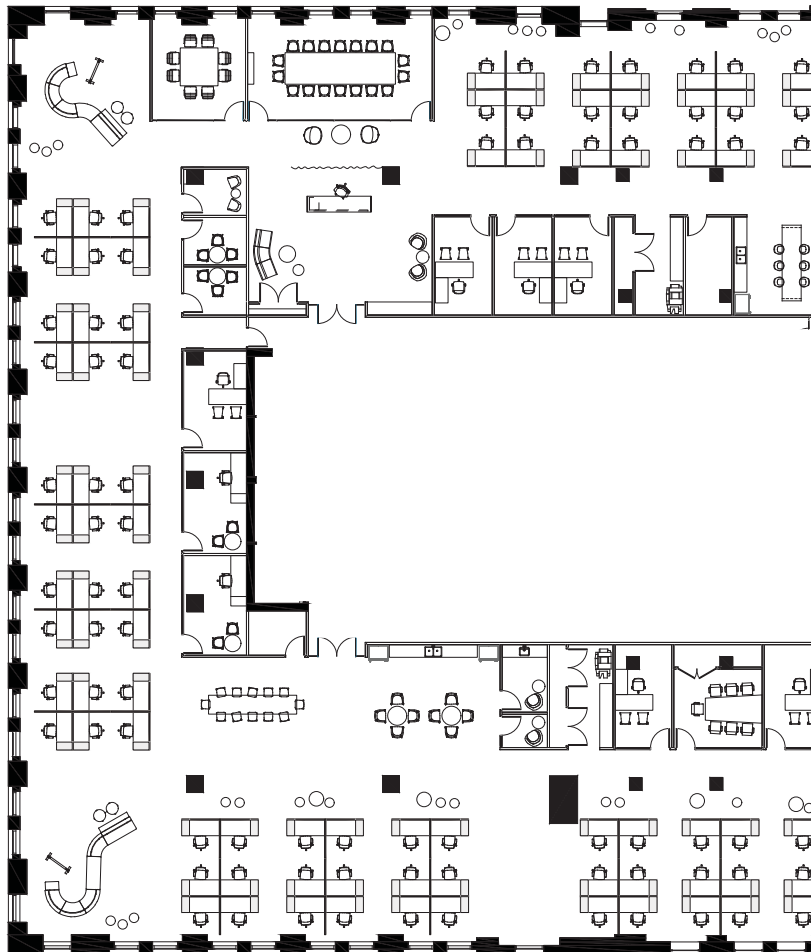
POTENTIAL SPEC SUITE DESIGN

Carey Spignese 312.669.8105 cspignese@tishmanspeyer.com